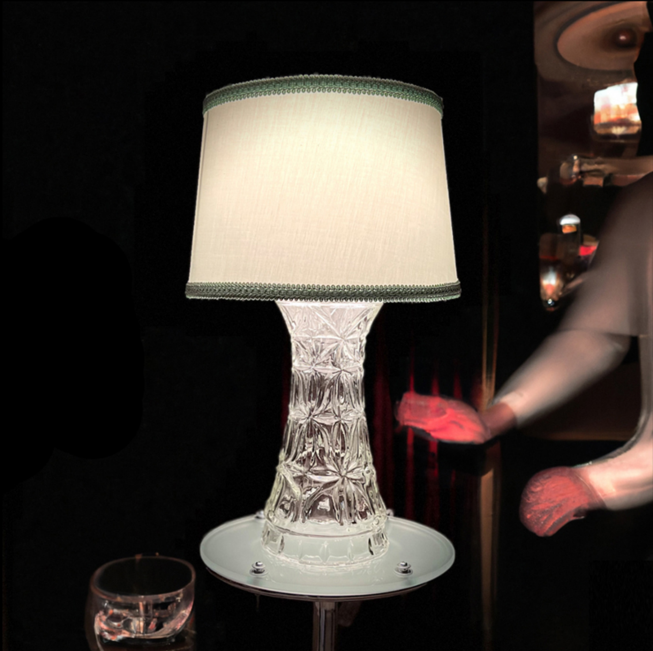
PRISMATIC MINT GLOW / ENLIGHTENMENT / JOHN FLO